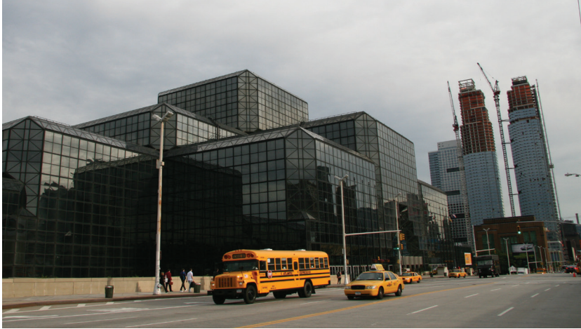
Located a few blocks from PABT, the Jacob K. Javits Convention Center was proposed as a new terminal site.

◆ Safety, security, and sustainability. Travelers and visitors to the terminal must feel safe and secure from petty crime and possible terrorist intrusions. The new terminal must be designed to be easily policed and to discourage and resist potential terrorist activity. The facility also should conserve resources and be energy efficient.